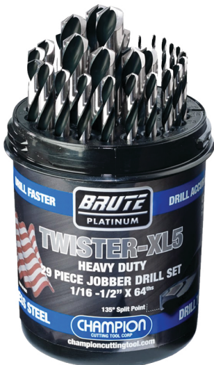
Part # /CH-TWISTER-XL5

FOR STAINLESS STEEL, TITANIUM ALLOYS, AND OTHER HARD TO DRILL MATERIALS